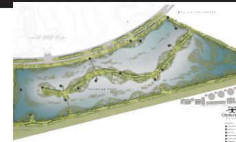
Cross Creek Ranch Polishing Pond

Investigation Investment Integration Innovation