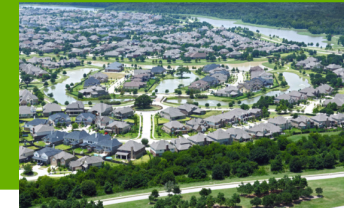
Bridgeland's Purple Pipe & Water Reuse System