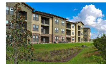
Queenston Manor Apartment Complex

Investigation Investment Integration Innovation