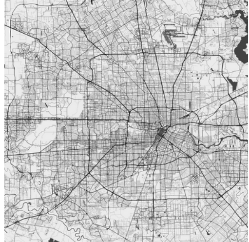
Monitoring Impacts Regarding Changes to ETJ, Land Development, & Annexation