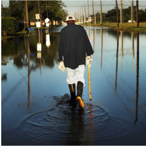
Funding for the Flood Infrastructure Fund & Projects In Our Region