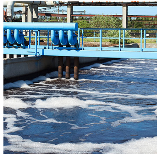
Raising Awareness of Water Supply Challenges & Water Reuse