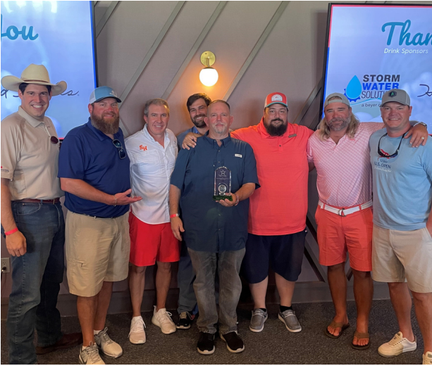
2023 Champions - Unitas Construction