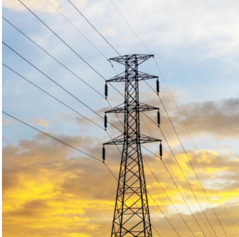
Exploring Nexus of Increasing Energy Demands, Reliability, & Effects on Development in the Houston Region